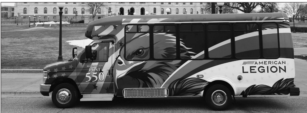
The Bloomington Post 550 shuttle bus went to St. Paul on March 30 for Veterans Day on the Hill. We transported about 15 veterans to the Capitol for the large gathering.

Non-Profit Org. U.S. Postage PAID Permit No. 467 Twin Cities, MN