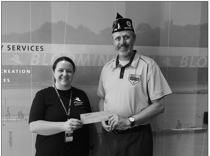
Bloomington Post 550 Gambling Manager hands a $10,000 check to the Bloomington Parks & Recreation Department to pay for fireworks during Summer Fete in Bloomington. The best thing about fireworks is everyone gets to enjoy the display.