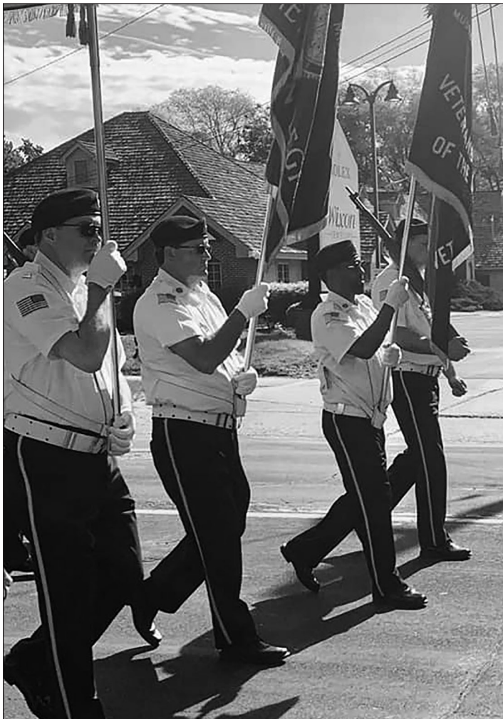
The Bloomington Honor Guard, made up of Legion and VFW members, led the Bloomington Memorial Day Parade on May 29. Everyone was surprised at the large crowds that lined Lyndale Avenue for the parade.

For VFW Post 1296's music schedule go online to vfw1296mn.us .